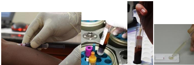
Blood Collection test device

Ubio Sensit Dengue IgG/IgM-NS1 Rapid test is a lateral flow assay designed so that even a technician with minimal expertise can perform the test easily. It is used for the qualitative and differential detection of antigen and antibodies specific to Dengue in human serum, plasma or whole blood.